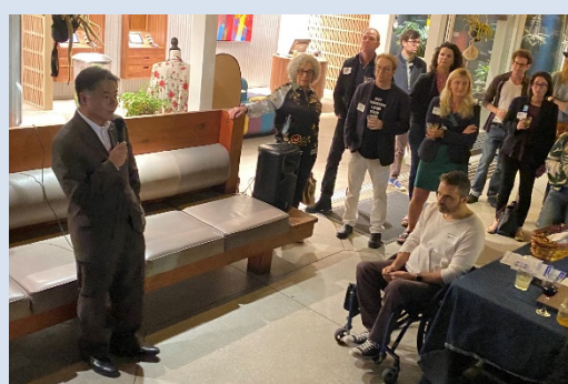
Our very own Congressman Ted Lieu (CA-33) headlined our first PAC event of this election season, sharing insights from the halls of Washington and challenging writers to recognize the power they wield in shaping the national discourse.