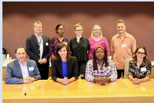
FCC Commissioner Jessica Rosenworcel visited the Guild to speak with writers about the changing media landscape, ways to increase competition and her scathing critique of the Sprint-T-Mobile merger.